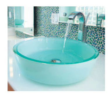
Aqua vessel sinks with Jado faucets are part of the master bathroom's waterfall theme. PAUL BURLINGAME

The ranch-style house's opposite wing contains the 1,100- square-foot game room, a playroom and a full bathroom. (The playroom has a three-level floor so