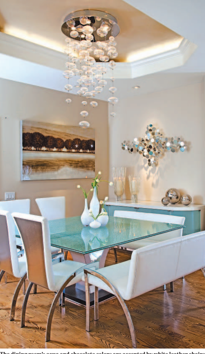
The dining room's aqua and chocolate colors are accented by white leather chairs and benches, which were chosen so kids can sit together.

Christy Scannell is a San Diego freelance writer and editor.